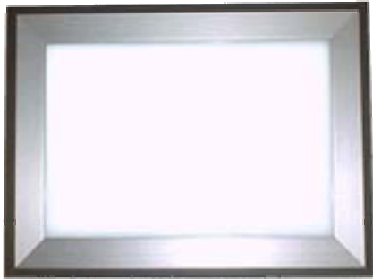
Advertising Panel (A4 size photo)